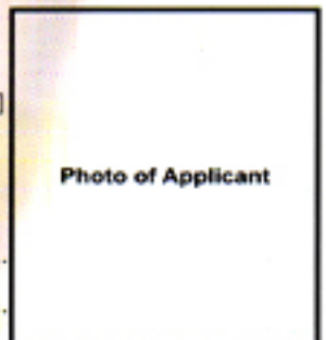
Photo of Applicant